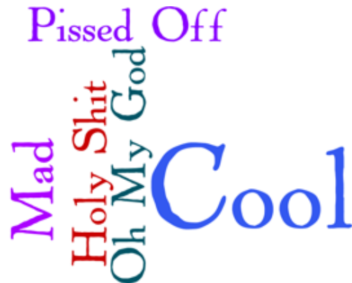
Figure 4: Baby Boomers