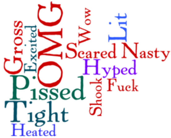
Figure 1: Digital Natives