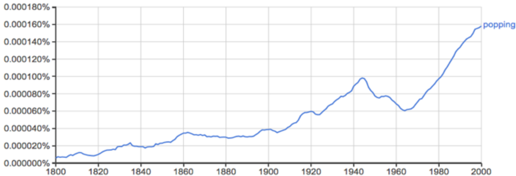
Figure 7: Google Ngram of “popping.” Depicts the frequency of the word “popping” in every word or short sentence across print sources from the 1800’s to 2000’s.