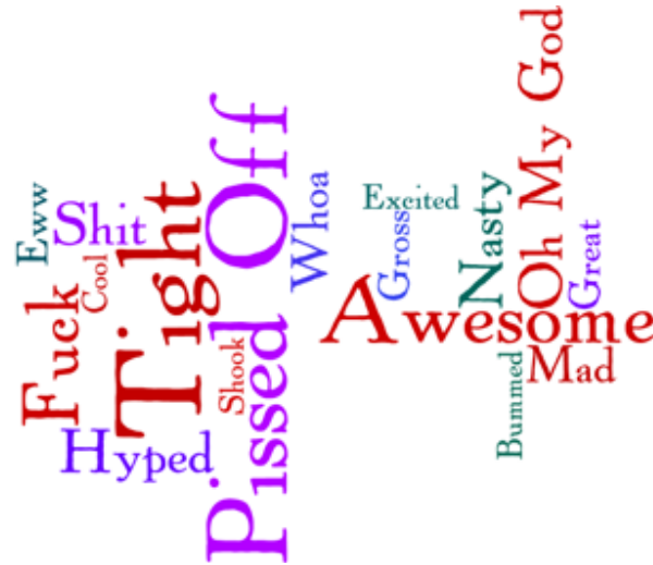
Figure 2: Millennials