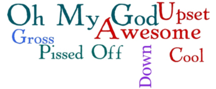
Figure 3: Generation X