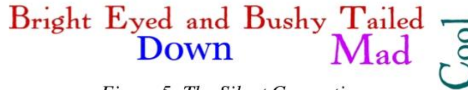
Figure 5: The Silent Generation