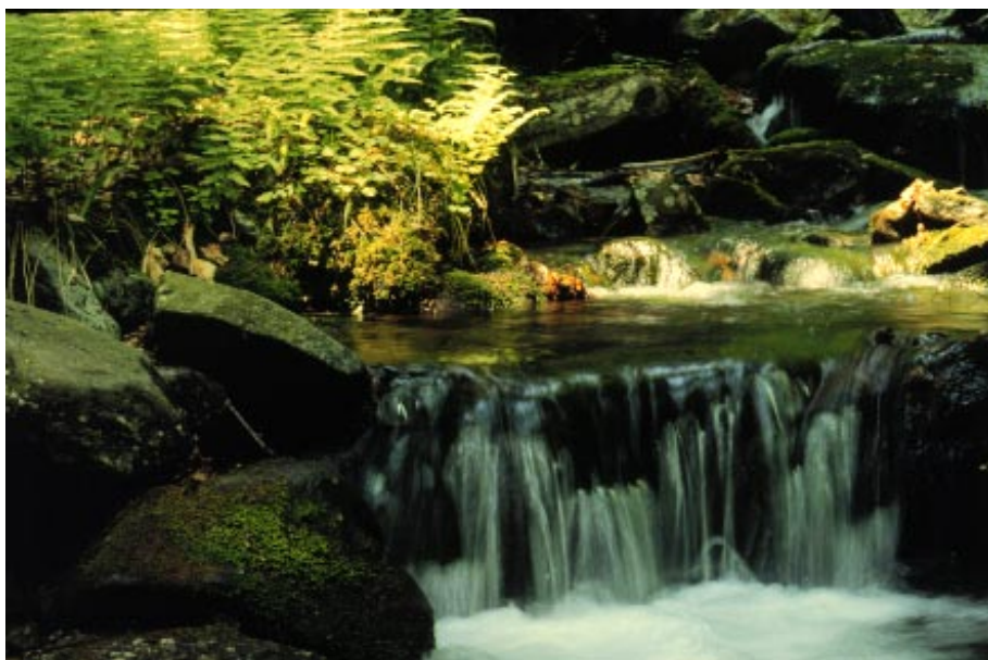
This branch of the Neversink watershed in the Catskills is under study by Donald J. Leopold.

▪ A group of Ringler's graduate students studies the effects of littoral zone modification on fish communities in Onondaga Lake. They built artificial spawning sites and planted aquatic vegetation. The next step is to build an observation jetty to monitor restoration results. The students also are looking at why there are so few zebra mussels