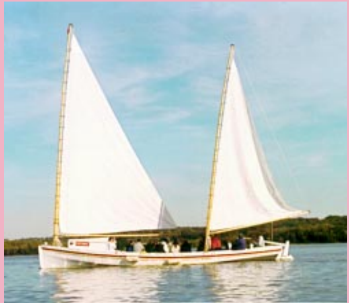
The Potomac in full sail.

The trees and the transportation were among the last in a series of donations that allowed the Potomac to be constructed by