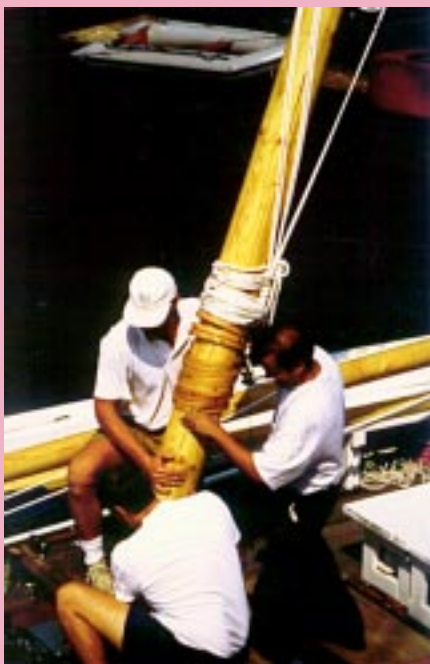
Volunteers help raise the mast.

He had this to say about ESF's role in the creation of the Potomac : "They aren't responsible for putting it in the water, but they're certainly responsible for making it sail."