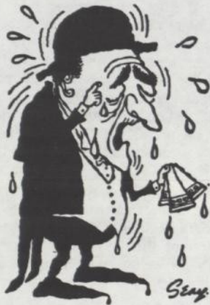
WINTER (?) HOLIDAY