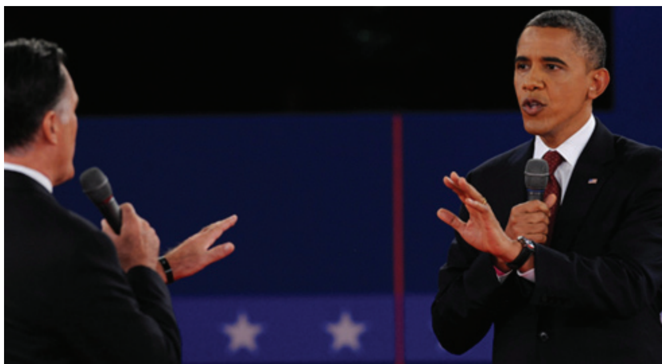
President Obama & Mitt Romney go at it during the 2nd Presidential debate

The Rapid Fire Favorites section was designed to help students get to know key people on campus. Got someone you want to know more about? How about question suggestions? E-mail us at Gateway@fmcc.suny.edu .