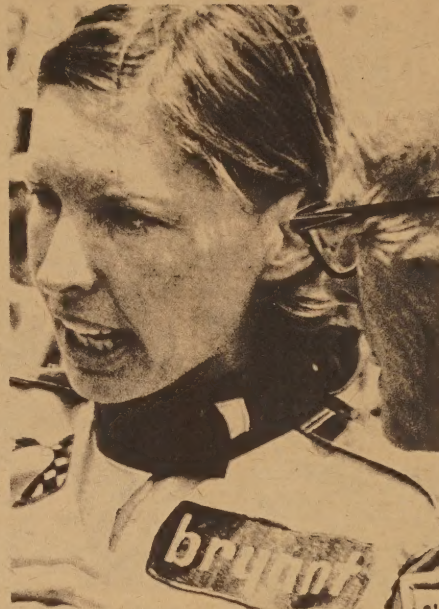
"Gentlemen? Start your engines". Janet Guthrie will try again at Indy—with a new car and a new sponsor. Good Luck Janet.

Who will drive into Victory Lane? Will it be A.J. Foyt for an unprecedented fifth time. Or will it be two-time winners Al Unser or Johnny Rutherford. Or maybe Gordon Johncock, Mario Andretti, or USAC's dark horse, the "Flyin Hawaiian" . . . Danny Ongais. Whoever it will be—you can bet all thirty three drivers will answer the call of "Gentlemen, start your engines."