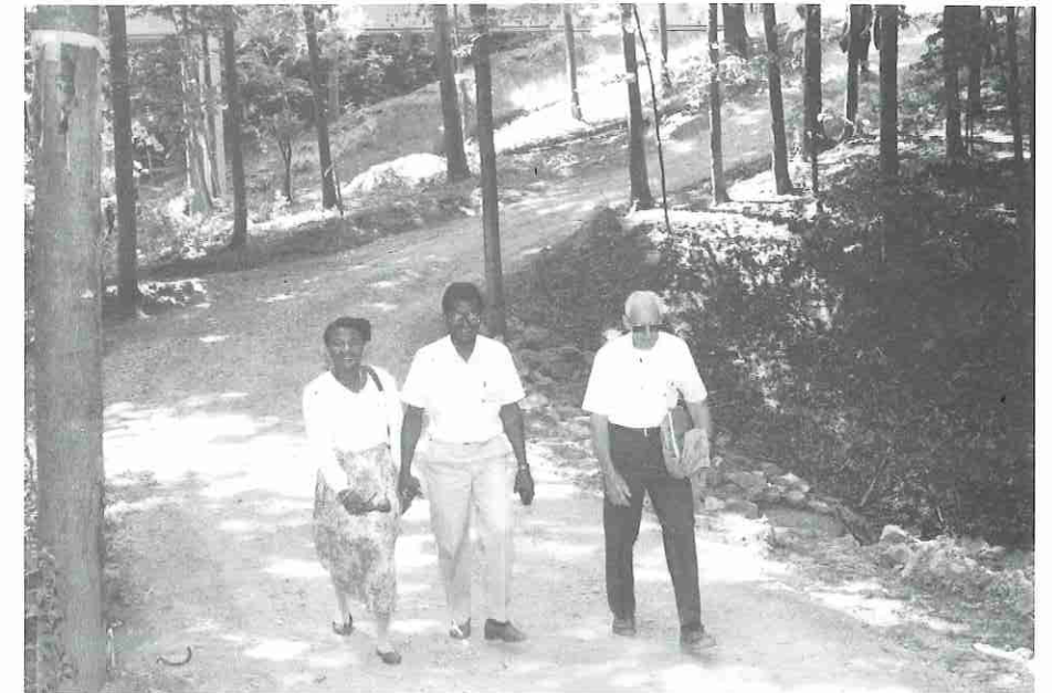
Alumni return after visiting the college's new residence hall complex at last year's weekend.

Sunday brunch and the annual meeting are the perfect conclusion to a weekend of fun and fond memories.