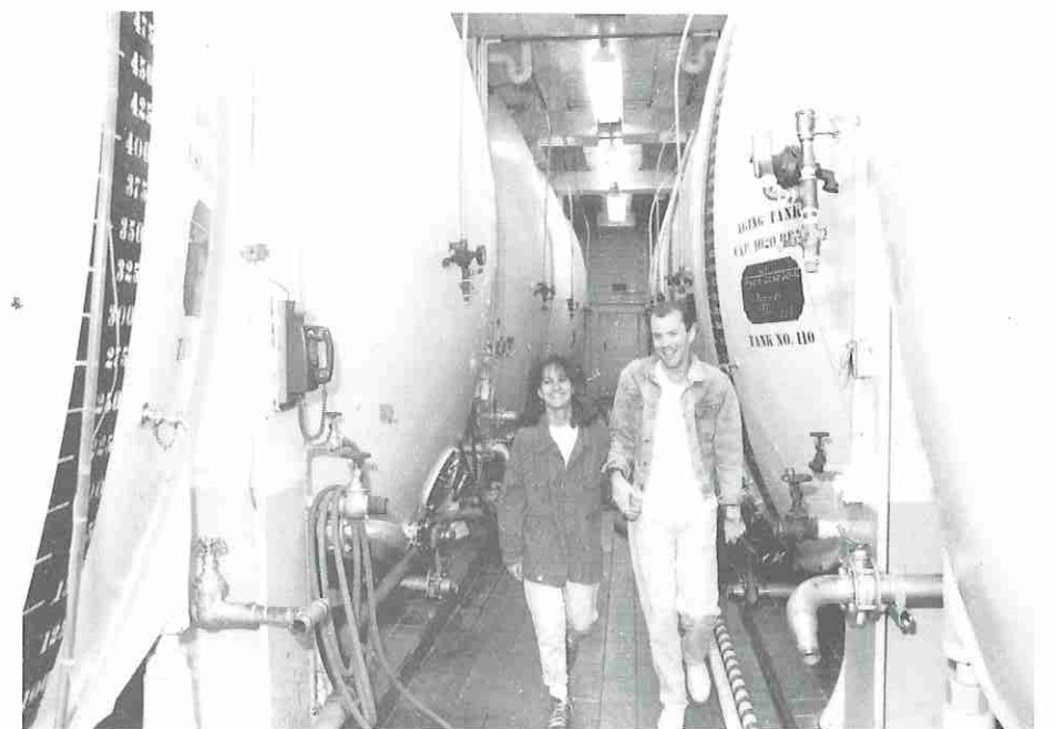
Touring the F. X. Matt Brewery at last year's Alumni Weekend.

Alumni Weekend is a great way to start off the summer!