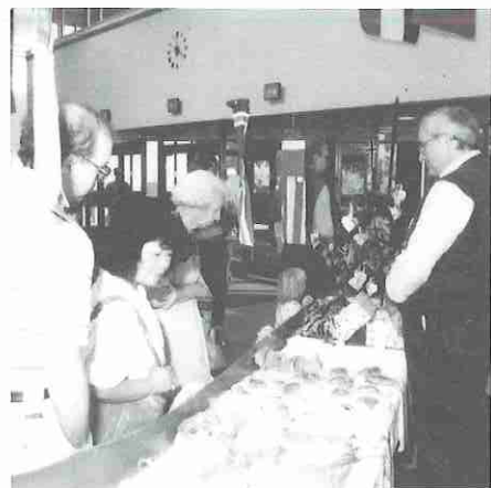
Sampling food at the Festival of Nations.