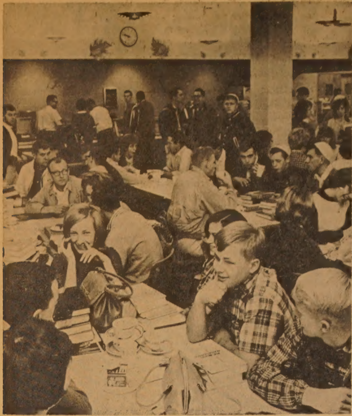
Cafeteria is overcrowded even before the three lunch periods begin.