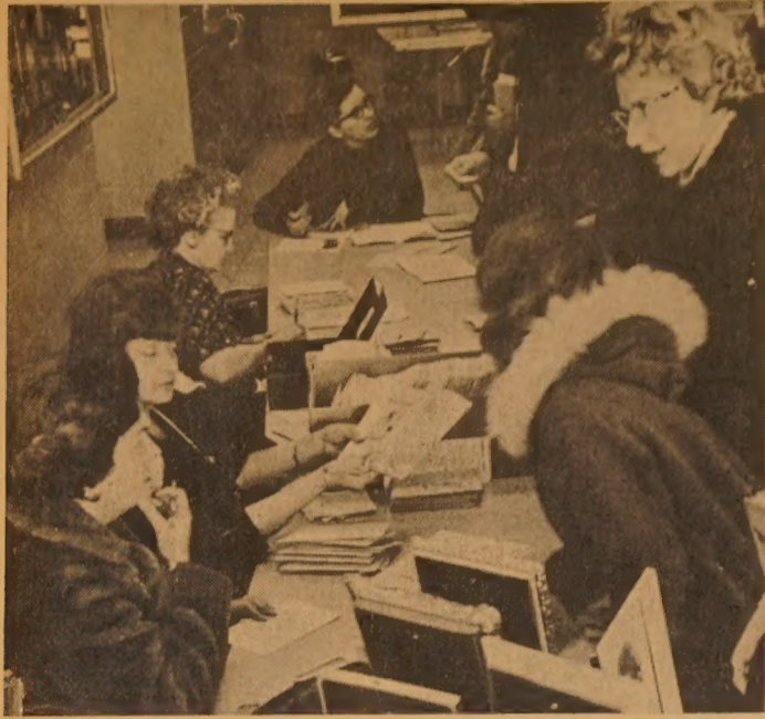
Seniors select yearbook proofs in the S. U. B.