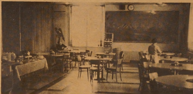
11:12 - Faculty out to lunch