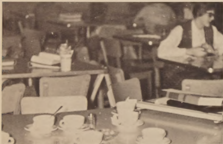
How do you like the scenery.

It might take a five-year old two weeks to learn that he shouldn't leave his play toys in the middle of the floor. Therefore, it shouldn't take a person of college age more than two weeks to learn a similar lesson!