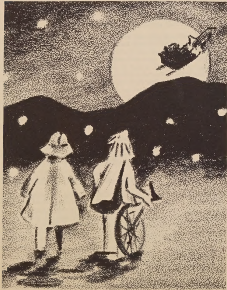
BEAR WITNESS, B.C., TO THE DISCOVERY OF SANTA CLAUS