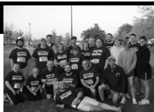
Chase Corporate Challenge