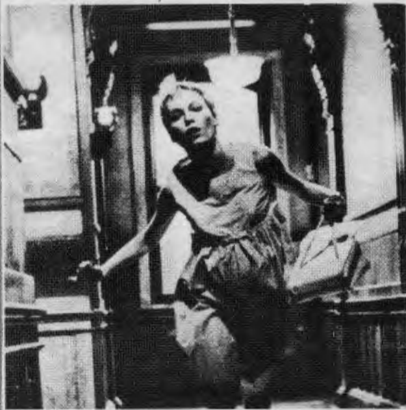
Mia Farrow in Thursday's film Rosemary's Baby