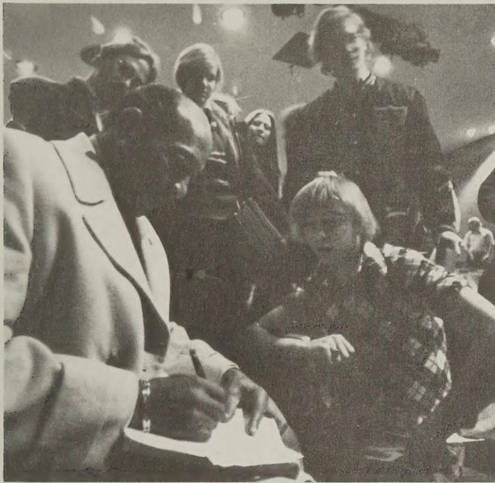
Jesse Owens, former world's fastest sprinter and winner of four gold medals in the 1936 Olympics, signs autographs for BCC students during his campus appearance last semester. Owens appeared in Binghamton at the invitation of PROBE, the local organization seeking prison reform, and BCC students helped to make his visit to Binghamton possible.

Lack of holdover players from last year's teams is forcing the coaches of Broome Community College's three men's varsity teams to depend on newcomers this spring.