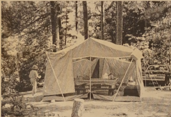
Rollins Pond is known for its spacious campgrounds and nearby facilities.

Rollins Pond is a true adventure away from home in the twenty-first century, and is close by to us in our own New York State.