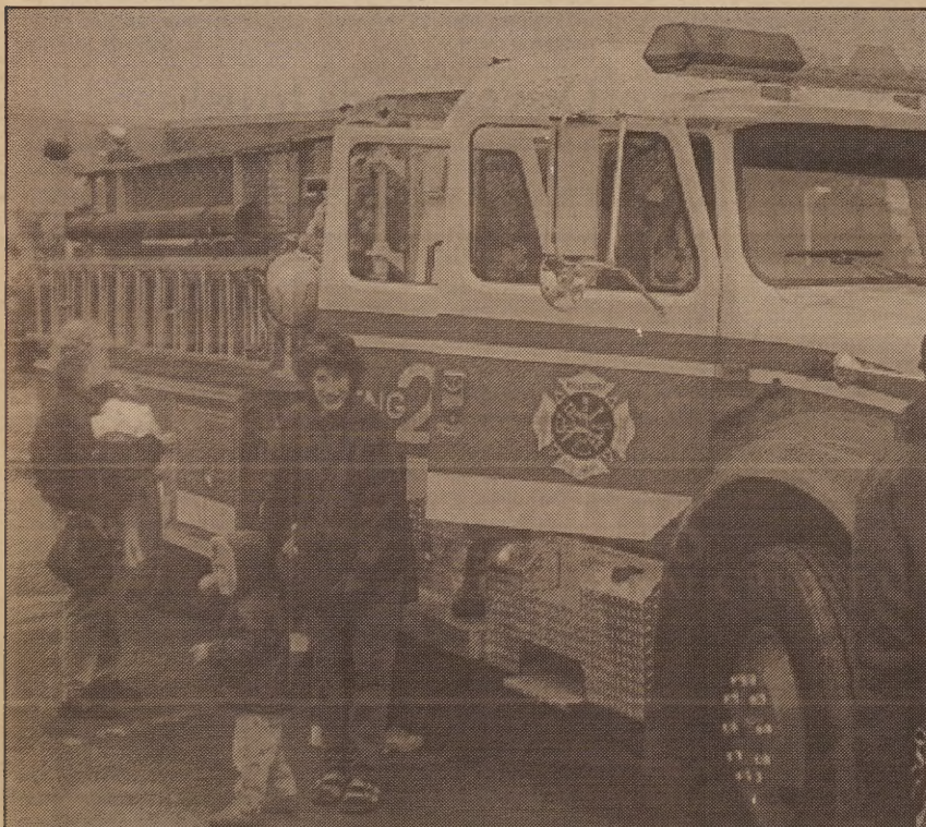
Above, most of the kids and some of the parents at the fair took turns climbing on and sitting in the fire truck. At right, one of the many families which attended the fair poses with Tigger. For more pictures from the event, see pages 4 and 5.

eryone throughout the Student Center. Proceeds from the fair go to the BAEYC scholarship fund.