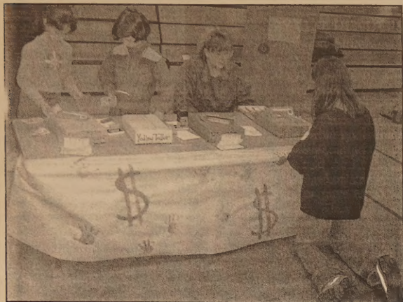
Above and below, the early childhood education department - a co-sponsor of the children's fair - runs a community bank, where kids could practice counting money, and a flower shop, where kids could make floral arrangements.