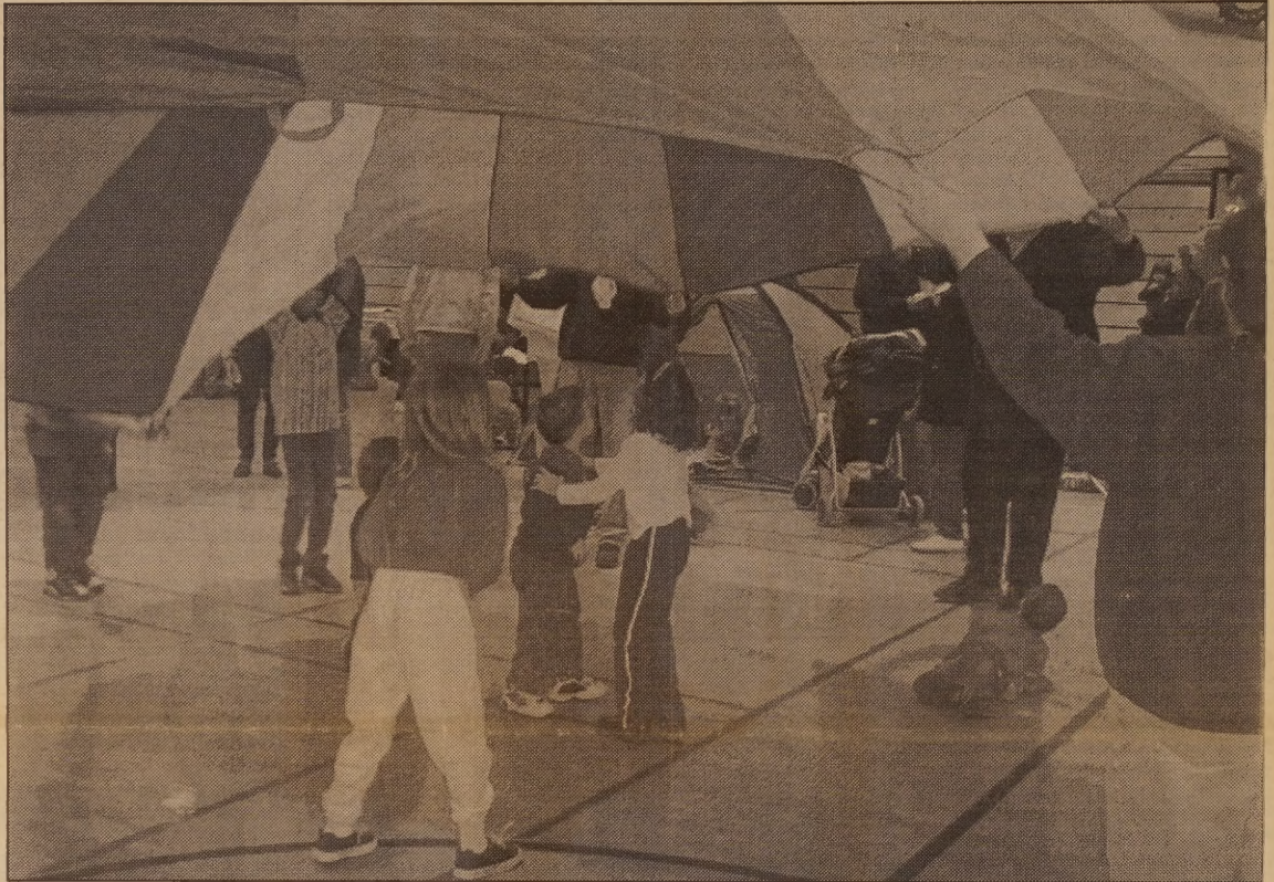
Sometimes simple fun is the best fun. Kids attending the March 31 Children's Fair play under a parachute volunteers lift above them.