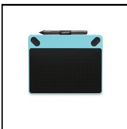
Wacom Drawing Tablet

Starting in the spring semester, the library will begin loaning two new technologies: iPads and a Wacom drawing tablet . We have acquired two iPad Air tablets that will follow similar checkout policies to our iPod Touches: faculty, staff, and students may borrow them at the Second Floor Service Desk for up to a week at a time, and may install any apps they wish. The iPads will be wiped and reset to prepare them for the next patron.