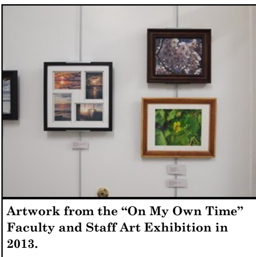
Artwork from the “On My Own Time” Faculty and Staff Art Exhibition in 2013.

Have you created artwork you want to show to your colleagues and everyone who visits the library? Here’s your chance to submit it to the 3rd Annual “On My Own Time” Faculty and Staff Art Exhibition! This event celebrates the creative talent of faculty and staff who are visual artists “on their own time.” Created in 1974 by CNY Arts, in cooperation with the Everson Museum of Art, On My Own Time is a community arts program that links the business and cultural sectors of Central New York to promote an appreciation of the arts and to recognize creativity in the