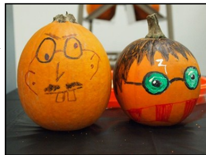
Library patrons decorated pumpkins on Halloween.