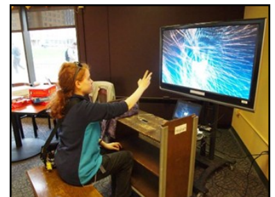
A student uses Leap Motion.