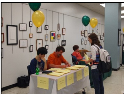
A student signs up for Writing Center help.