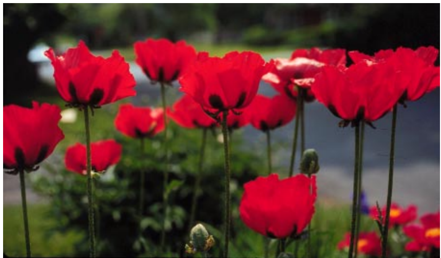
A garden sampler from Don Leopold: far left, a salmon poppy surrounded by lupines; top of page, a tiger swallowtail butterfly rests on a rhododendron; above: red poppies stand tall.

Definitely not the regular fare found in local gardens, kiwi fruit may seem too exotic to grow in Central New York.