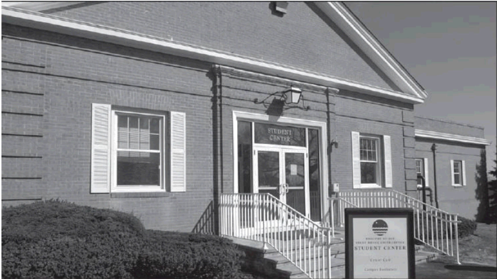
The Student Center at Stony Brook Southampton, which would be expanded under a current plan.