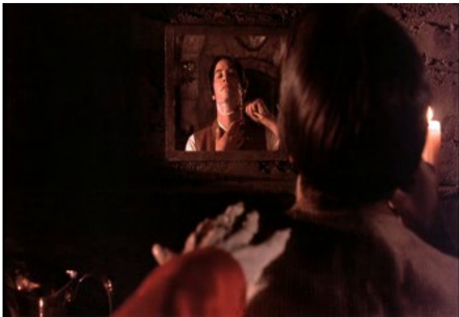
Our vampire cannot be seen inside of the mirror.