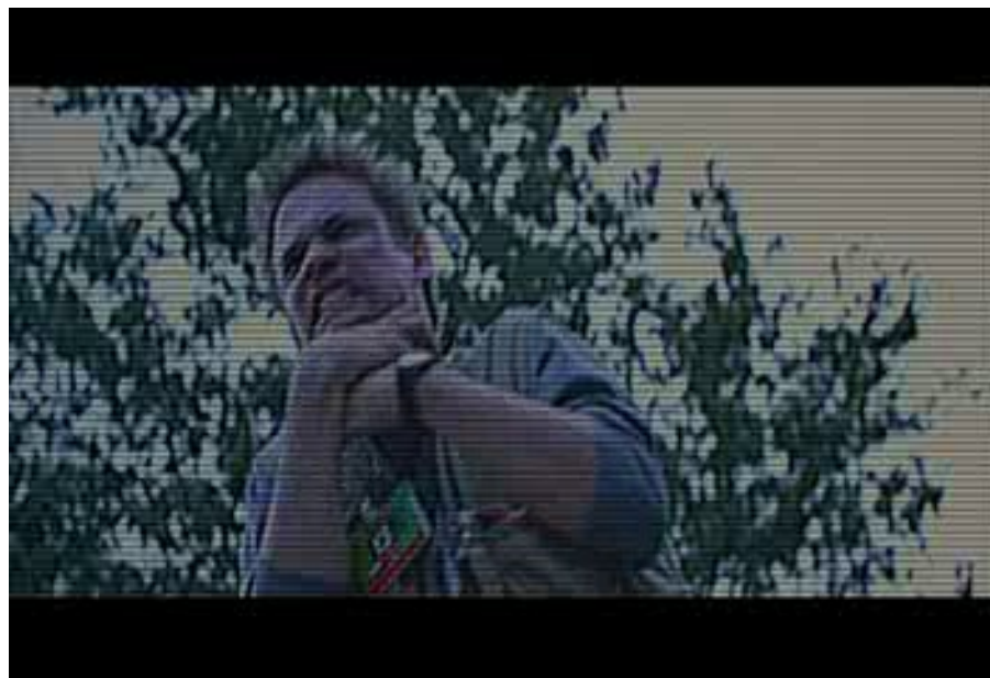
The cameraman is being attacked by Dracula though he cannot be seen on the screen.