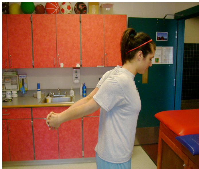
Figure 4. Anterior deltoid, pectoralis and biceps stretch