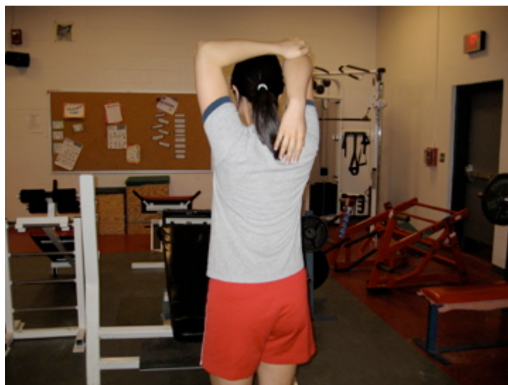
Figure 2. Triceps overhead stretch