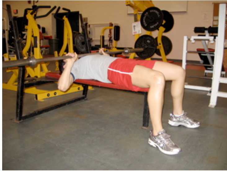
Figure 1. Proper bench press form

During the second session, subjects performed their given flexibility routine, which was randomly assigned by the researcher. No more than two participants tested at the same time due to the availability of benches, bars and volunteers. Rest time between the flexibility routine and the 1RM was exactly three minutes in between the stretch and the lift. This rest time was chosen as to mimic a flexibility routine preceding an actual athletic event. Once the new estimated 1RM was calculated, it was recorded and the % value of increase or decrease was calculated.