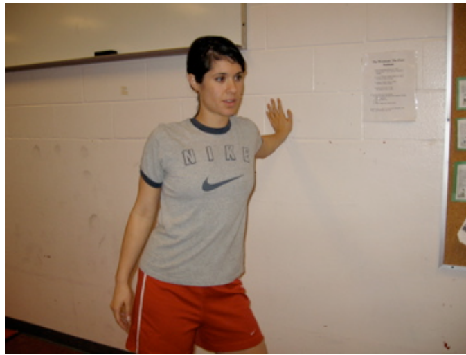
Figure 3. Pectoralis major stretch